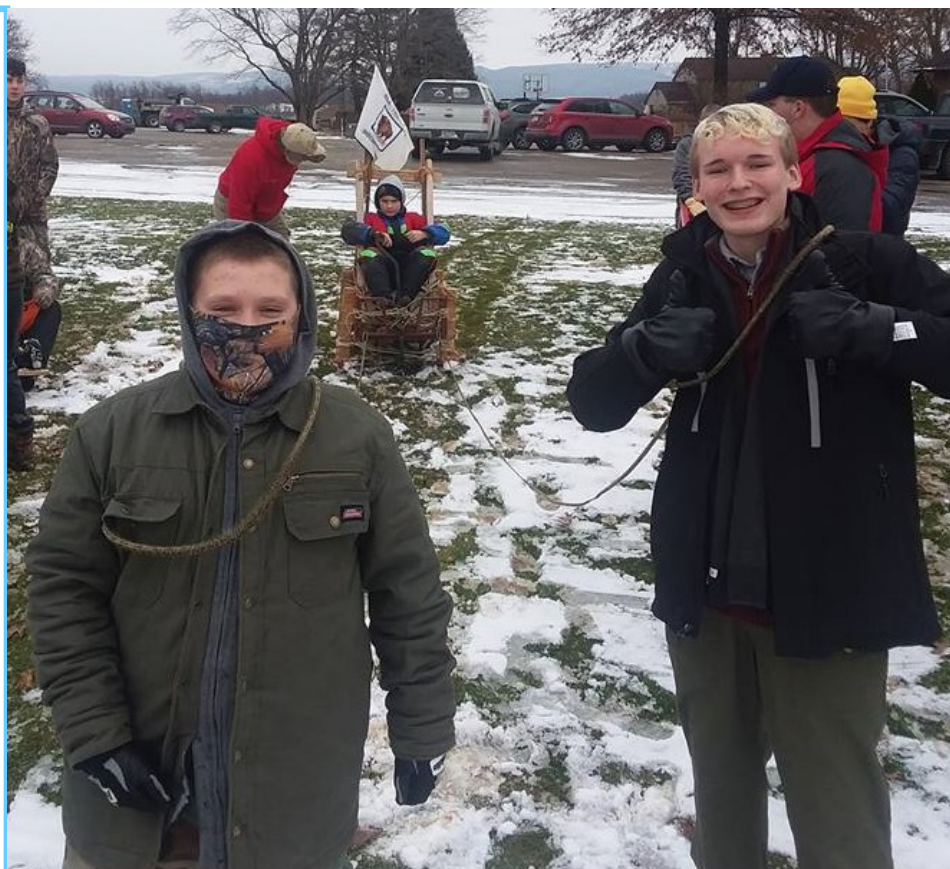
Troops 643/625 Ready to Race!