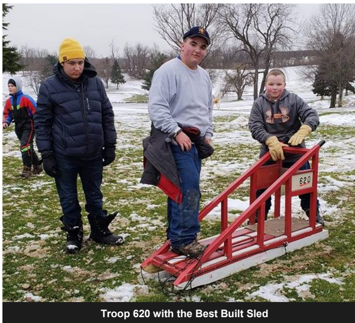
Troop 620 with the Best Built Sled