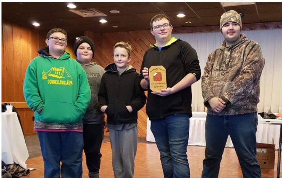
Troop 111, Connellsville Pa. 1 st Place Patrol, 2019 Klondike Derby; Will they keep the Title?!

Sound good? You're doggone right! Every Scout will want to be in the Derby. Look over the enclosed plan, talk it up with the Scouts and get the patrols working now! The Klondike Derby is the BIGGEST winter activity happening in the Old Trails District!