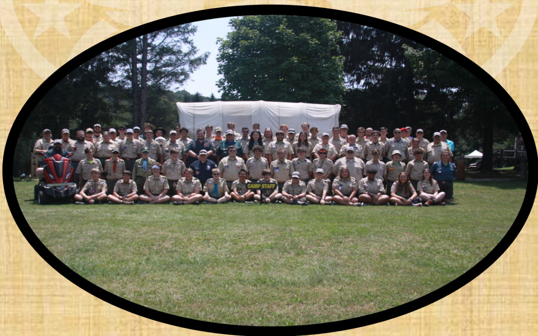
2021 Eberly Scout Reservation Staff

The mission of the Boy Scouts of America is to prepare young people to make ethical and moral choices over their lifetimes by instilling in them the values of the Scout Oath and Law.