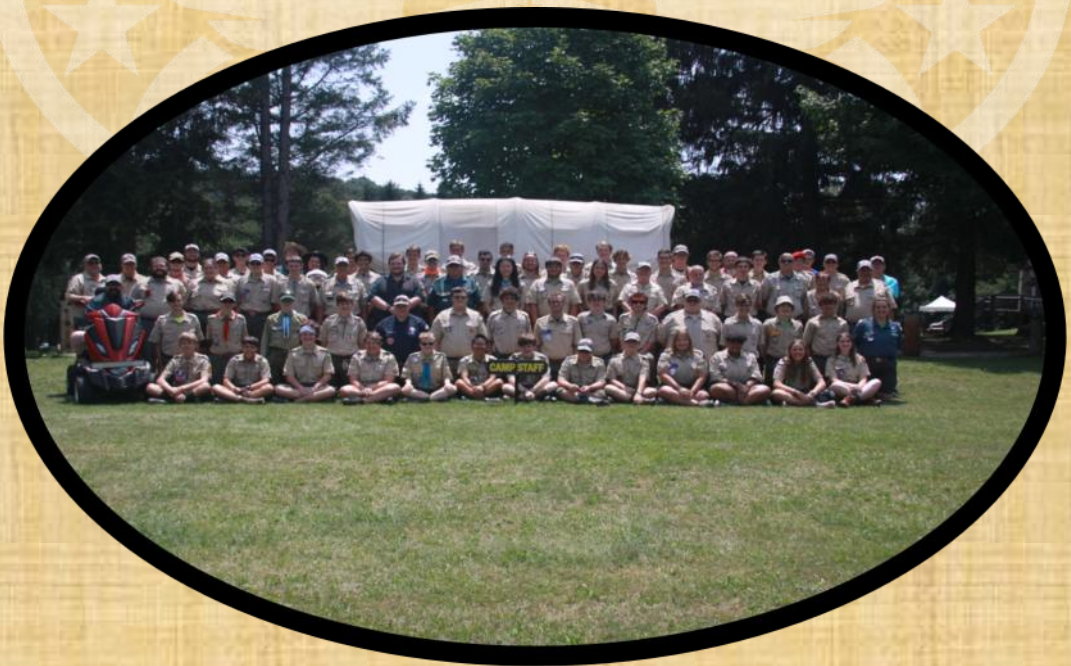
2021 Eberly Scout Reservation Staff

The mission of the Boy Scouts of America is to prepare young people to make ethical and moral choices over their lifetimes by instilling in them the values of the Scout Oath and Law.